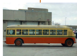
Twin Coach 30GS