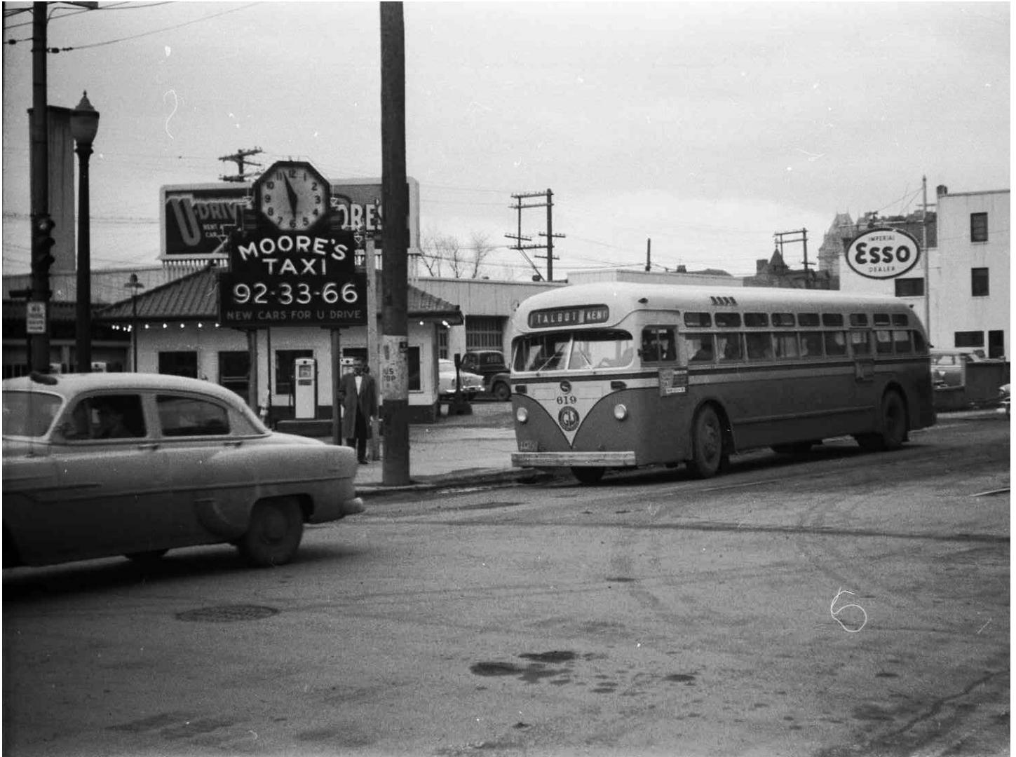
Greater Winnipeg Transit Commission bus #619 seen stopped at the corner of Donald and Graham next to the Moore's Taxi headquarters. This bus was a 1953 Mack model C47DT which carried 47-passengers. This unit was retired from active service in 1967.