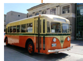
Twin Coach 23R