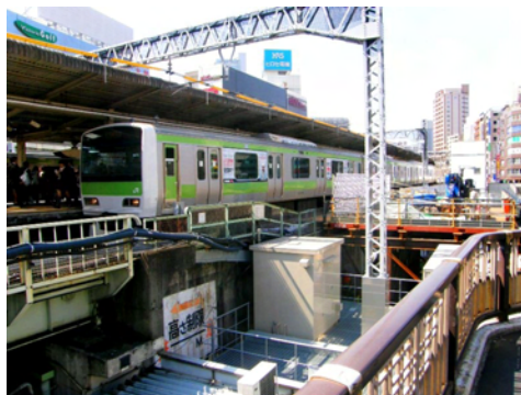
An estimated 3.5 million passengers ride every day on Tokyo's Yamanote Line, with its 29 stations. In comparison, the New York City Subway carries 5.08 million passengers per day on 26 lines serving 468 stations and the London Underground carries 2.7 million passengers per day on 12 lines serving 275 stations.

Perhaps the MTHA could do this with an old Streetcar for Winnipeg?