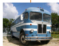
General Motors TDH-4517