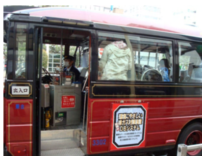
Known as "little Edo" meaning little Tokyo, the City of Kawagoe (population 335,000) is located about 60-minutes by Train from Central Tokyo. Kawagoe is famous for it's sweet potatoes (including sweet potato ice cream, candy and beer) and for its well preserved traditional architectural warehouses.

Above, an orange Tobu-Line bus operates through central Kawagoe toward the main bus station.