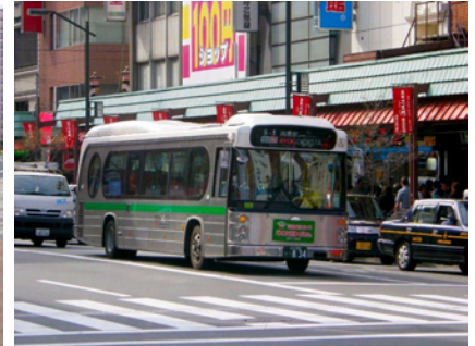
Tokyo Shitamachi Bus - a sightseeing tour bus operated by TOEI approaching the ancient Senso-ji Temple in the Asakusa district of Tokyo.