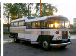
Western Flyer T-38/40