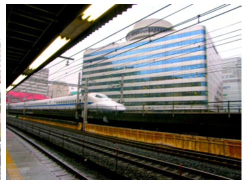
The Tokaido Shinkansen is a high-speed rail line, opened in 1964 between Tokyo and Shin-Osaka. It is operated by the Central Japan Railway Company (JR Central) and has a top travelling speed of 270km/hr!

Kyoto is a city in the central part of the island of Honshu, Japan. It has a population of nearly 1.5 million people and was formerly the imperial capital of Japan. The UNESCO World Heritage Site Historic Monuments of Ancient Kyoto includes 17 locations (mainly Buddhist and Shinto Temples) in Kyoto. The Kyoto City Bus, pictured on the right, provides five main tourist routes that provide a quick and convenient link to the heritage sites.