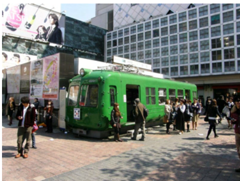
Located at the very busy Shibuya Crossing in Tokyo, this original 1950s era subway car stands on display as both a museum and sitting shelter for the public.

Perhaps the MTHA could do this with an old Streetcar for Winnipeg?