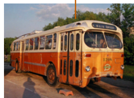
Western Flyer T-36 2L