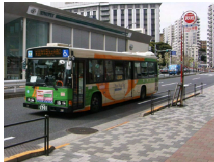
A Bureau of Transportation Tokyo Metropolitan Government (TOEI) bus travels down Meguro-dori (street) toward Central Tokyo.

I rode on buses in the cities of Tokyo, Kyoto and Kawagoe, experienced being pushed onto the crowded subway in rush hour Tokyo, and travelled on the Shinkansen (Bullet Train) from Tokyo to Kyoto, a journey of 600 km in 2-and-a-half hours! I am pleased to share a few pictures of my trip with you. Enjoy.